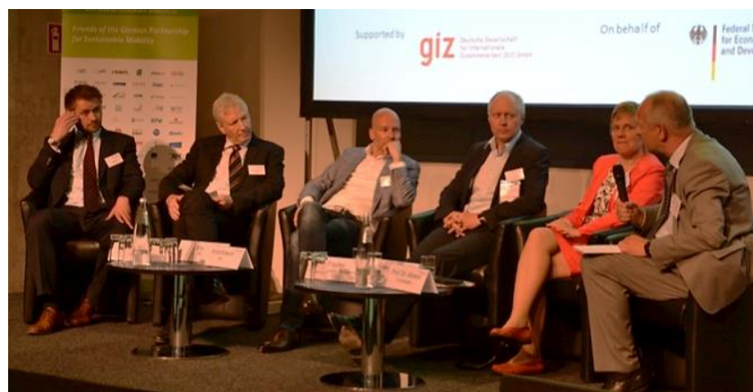
On behalf of

giz Deutsche Gesellschaft für Internationale Zusammenarbeit (giz) GmbH